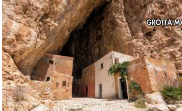
GROTTA MANGIA PANE