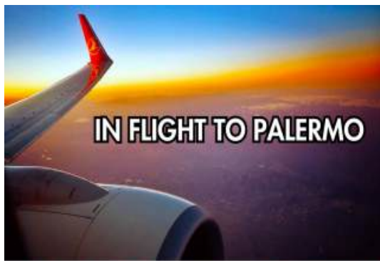
IN FLIGHT TO PALERMO